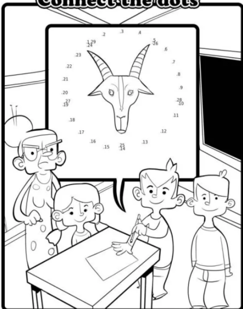
Damian is showing his class the way to make an inverted pentagram. Connect the dots to make one yourself.